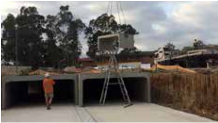
Storm water and water control