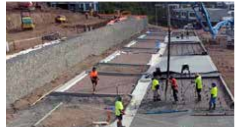
Commercial Industrial Concrete

One specialist team = streamlined solutions for small-medium civil construction projects.