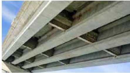
Off-form concrete structures